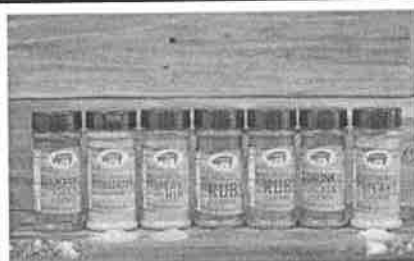
C COUNTRY PLEASIN' SIGNATURE RUBS

Box includes (5) 14oz packs of ORIGINAL FLAVOR sausage