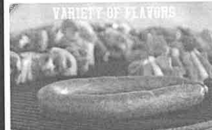
F COUNTRY PLEASIN' VARIETY SAUSAGE PACK