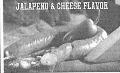
D COUNTRY PLEASIN' JALAPENO & CHEESE PACK

Perfectly seasoned Hickory Smoked 7-8lb precooked weight