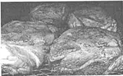
A COUNTRY PLEASIN' SMOKED BOSTON BUTT