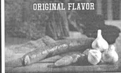
E COUNTRY PLEASIN' ORIGINAL SAUSAGE PACK

Perfectly Hickory Smoked; injected and marinated to ensure juiciness 5-6lb precooked weight